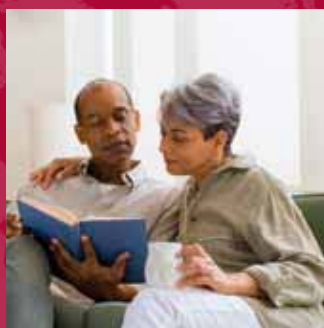
WAITING FOR MEDICARE COVERAGE