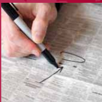
TRANSITIONING BETWEEN JOBS